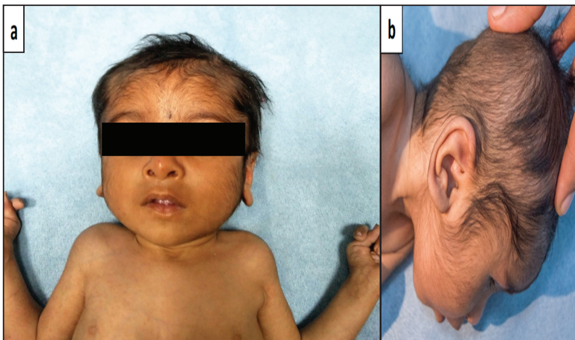
Figure 2. Facial profile (a. frontal and b. side); mongoloid slant, epicanthal folds, hypertelorism, anteverted nares, micrognathia (a), low anterior and posterior hair line and low set dysplastic ears (b) can be noted.

Further investigations were done to detect other systemic abnormalities. Non-contrast computerized tomography of the head showed gross dilatation of the temporal horn, body, and occipital horns of both lateral ventricles which appear to be fused in the midline posteriorly without visualization of inter-ventricular septum and bilateral fused thalami, suggestive of Semi lobar holoprosencephaly (Figure 3a). Echocardiography revealed hypertrophic non-